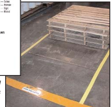
Above: Right-to-Know Label Right: Creating order by marking floors and walls for frequently used items.

It is also important to consider installing shelving and cabinets that are easily accessible and can be adjusted as necessary. Because production requirements can change frequently, it is important to implement an organization system that is customizable.