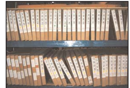
After 5S implementation