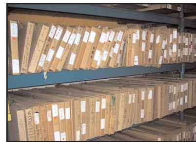
Before 5S implementation

The 5S philosophy may be applied to most any workplace scenario in a short period of time due to its simple nature. However, we are aware that most every organization has specific needs. If you have questions about how Graphic Products can assist you as you implement your 5S program , please feel free to contact us at any time using the information printed on the front of this booklet.